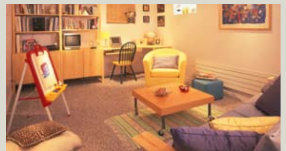
Typical carpet installation.